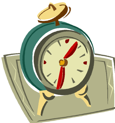
air conditioning system or heat pump